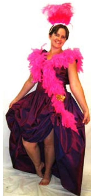
Costume Name: Saloon Girl Costume #: CO1870.305 Description/Notes: Purple/pink feathers Components: Measurements: