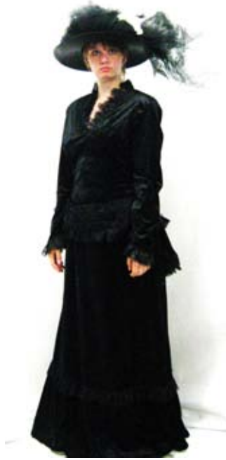
Costume Name: Victorian Dress Costume #: CO1870.202 Description/Notes: Black velour Components: Measurements: