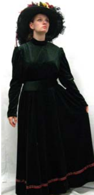
Costume Name: Victorian Dress Costume #: CO1870.204 Description/Notes: Hunter/plaid trim Components: Measurements: