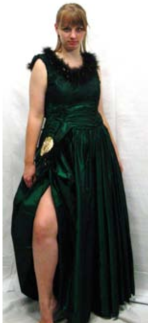
Costume Name: Saloon Girl Costume #: CO1870.303 Description/Notes: Hunter green Components: Measurements: