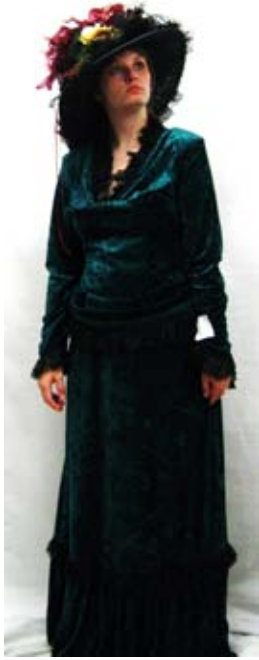
Costume Name: Victorian Dress Costume #: CO1870.201 Description/Notes: Green velour Components: Measurements: