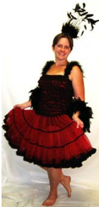
Costume Name: Saloon Girl Costume #: CO1870.304 Description/Notes: Red/black lace Components: Measurements: