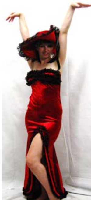
Costume Name: Mae-dam West Costume #: CO1870.301 Description/Notes: Red velour strapless w/hat Components: Measurements: