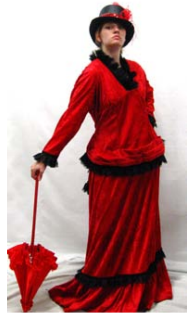
Costume Name: Victorian Dress Costume #: CO1870.203 Description/Notes: Red velour Components: Measurements: